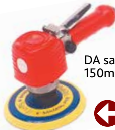
DA sander. 150mm x 5mm orbit

$186.00 W5061-K 1/2" Impact Wrench Kit. 10 sockets plus accessories