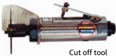
Cut off tool