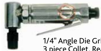
1/4" Angle Die Grinder. 3 piece Collet, Rear Exhaust

$295.00 W5212 Angle Grinder 4". Heavy Duty with Governor Mechanism. Ball Bearing Construction. Safety Guard and Side handle. (W5212-1 is 5" version)