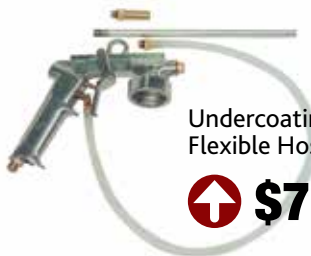
Undercoating gun with Flexible Hose