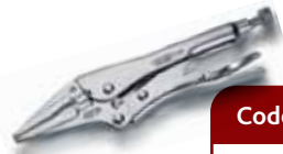
DAAS Long Nose