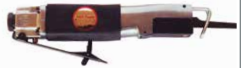
Body saw. Ideal for muffler & body shop repairs

$248.00 (10MM) W5116 $349.00 (20MM) W5117-1